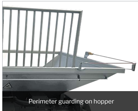
Perimeter guarding on hopper