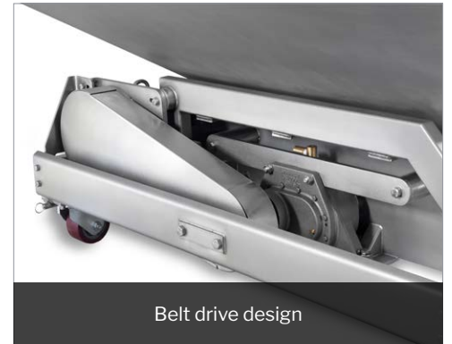
Belt drive design

For additional information or to request a quote, call +1.937.652.2151 or email info@shaffermixers.com .